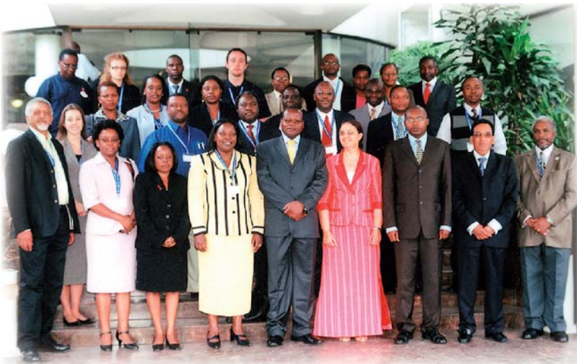
Participants at the Nairobi meeting on HIV / AIDS